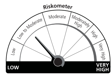
Investors understand that their principa will be at moderate risk

*Investors should consult their financial advisers if in doubt about whether the product is suitable for them.