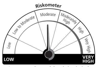
Investors understand that their principal will be at moderate risk